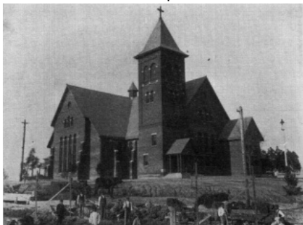
"The Chapel."