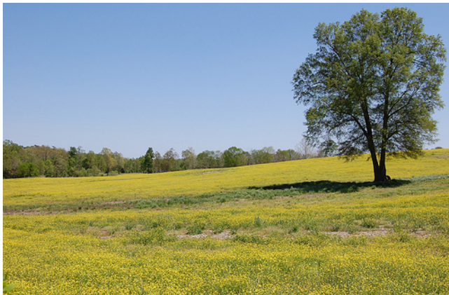
Pardue, Donald Lee. 2009. "Fields of Gold." Photo taken in Chatham County, NC.