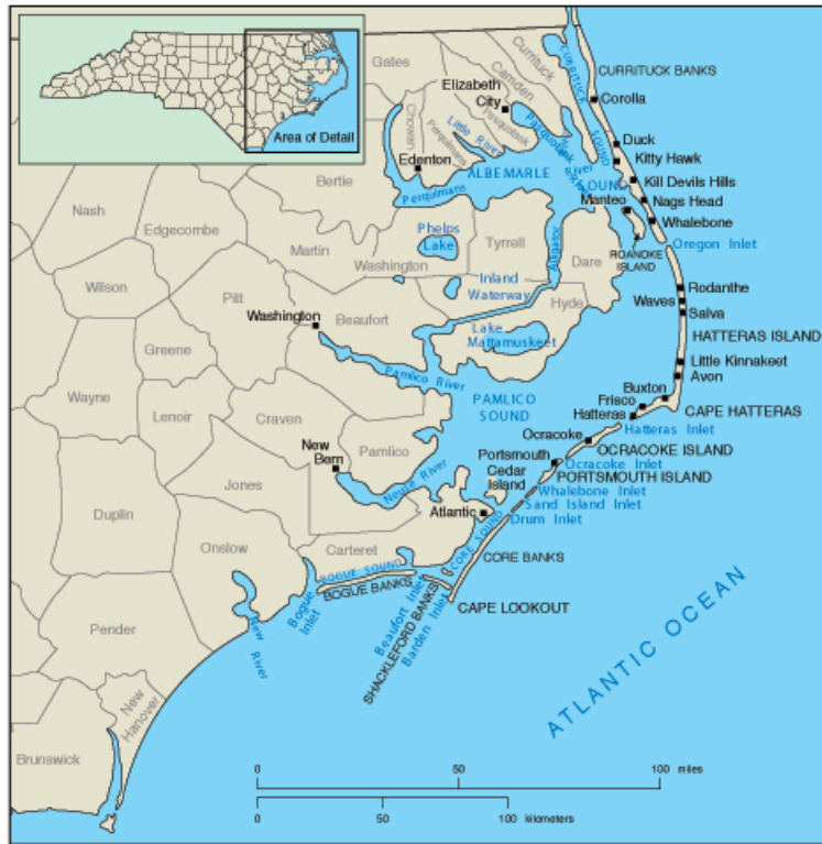
Figure 5. Major Coastline Features of the Outer Banks