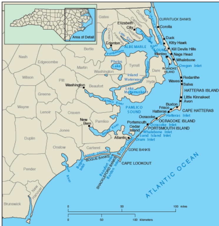
Figure 5. Major Coastline Features of the Outer Banks