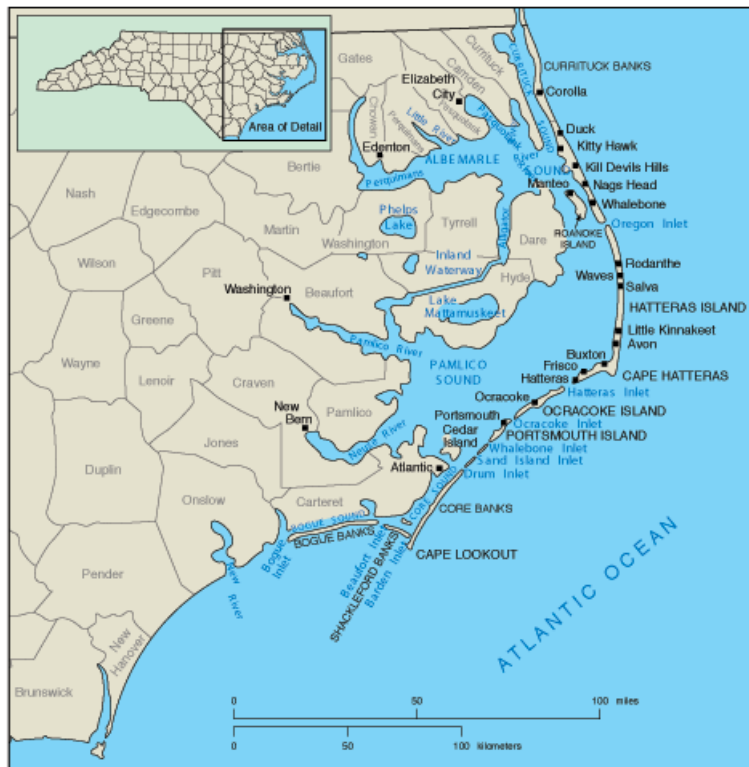
Figure 5. Major Coastline Features of the Outer Banks