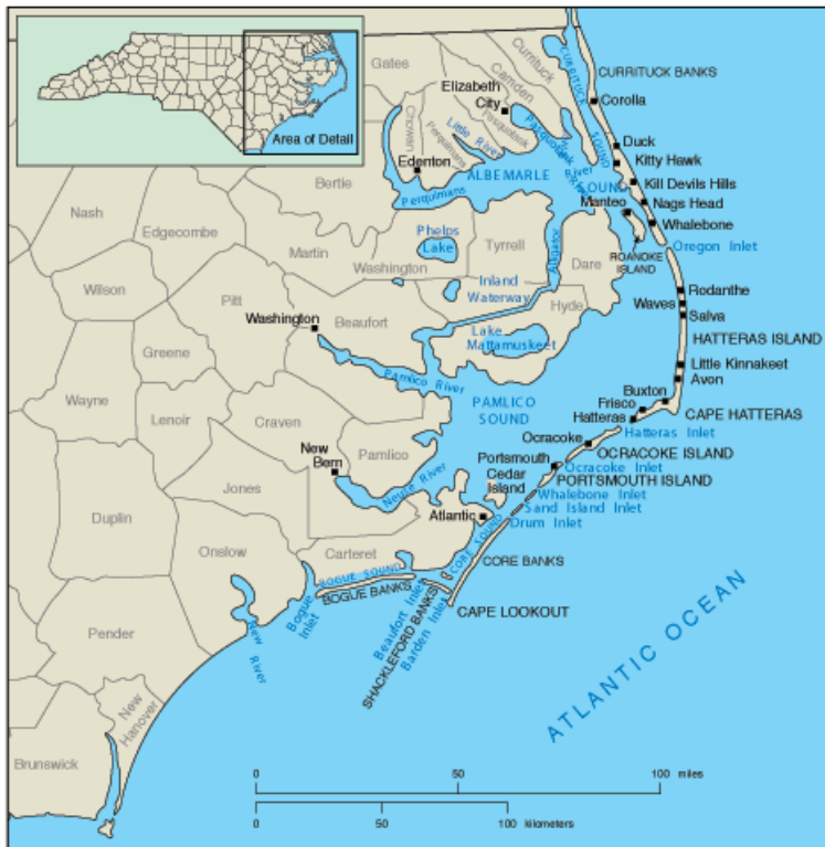
Figure 5. Major Coastline Features of the Outer Banks