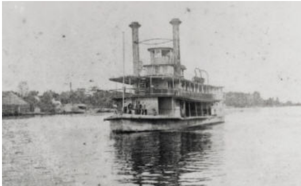
"Cape Fear River Steamboat." 1905.

[3] The general history of steamboating in North Carolina is rich. When President Monroe [4] visited Wilmington [5] , he was taken to Smithville [6] on a steamboat named Prometheus . Another steamboat, the SS Arapahoe , was the first ship in North America to send an SOS distress message. Not surprising, this event occurred in 1909 off Cape Hatteras [7] , where many ships met trouble.