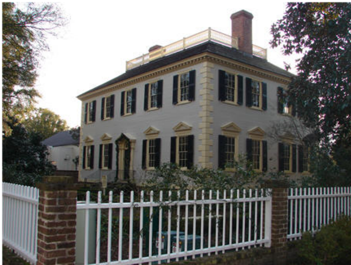
John Wright Stanly house, New Bern, NC.

available resources with simple, functional building techniques brought from Europe. Often lacking affluence and skilled artisans to create grand residences, most early settlers constructed homes to provide basic shelter rather than to establish permanence or demonstrate wealth or power. The landscape and climate [13] of North Carolina impacted early construction, as well. Large forests provided a seemingly endless supply of timber – unlike the English farmlands with which many settlers were familiar – and early immigrants took advantage of this abundance by building most structures, including their homes, with wood. The hot, humid climate also influenced different building methods than those of English tradition. Among them, large porches, separate kitchens, and open breezeways were built to help keep occupants cool. These building techniques persisted in the state through the nineteenth century. ( Architects & Builders in North Carolina , p. 9-10) [12]