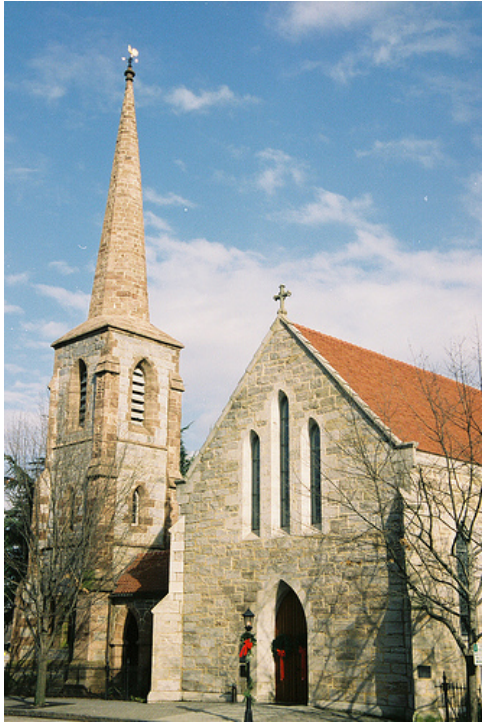
Christ Episcopal Church, Raleigh, NC.

[17] The advent of the railroad made building materials easier to mass-produce and distribute. At the same time, the architectural profession was beginning to define itself, and it is in this era that individual architects began to be associated with the buildings they constructed. In North Carolina, as in the rest of the nation, Greek Revival [18] , Gothic Revival [19] , and Italianate [20] styles were embraced and used in both public and private building to promote the power and permanence of the new nation and its citizens. Two standout examples from this time period are both located in Raleigh [21] : Christ Episcopal Church (designed by Richard Upjohn [22] , the founder of the American Institute of Architects [23] ) and the North Carolina State Capitol (designed by Thiel Town [24] and Alexander Jackson Davis [25] ). ( Encyclopedia of North Carolina , p. 62)