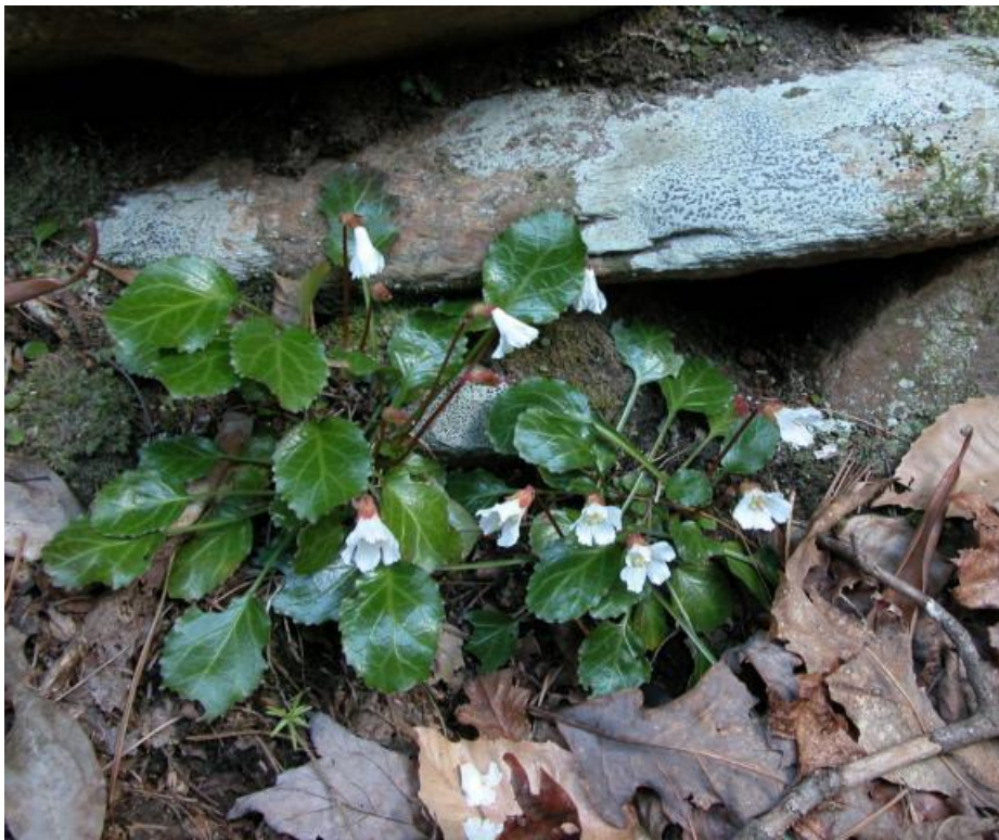
Northern Oconee Bells, Shortia galacifolia var. brevistyla