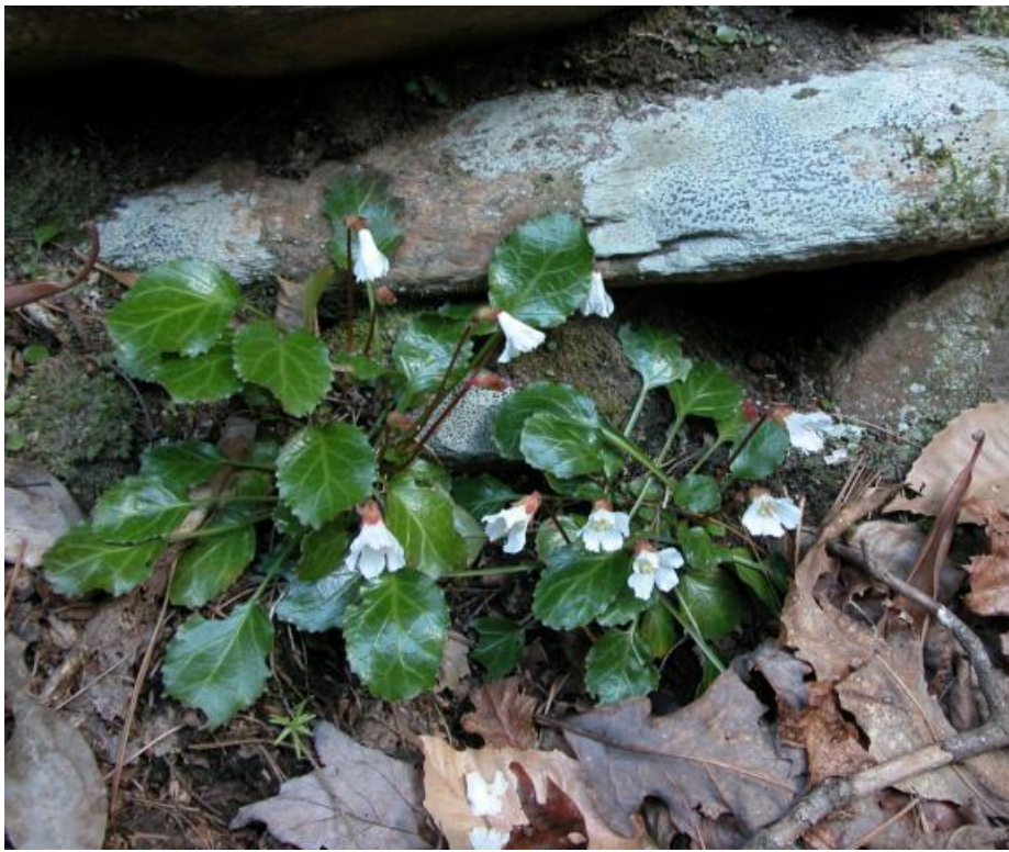
Northern Oconee Bells, Shortia galacifolia var. brevistyla