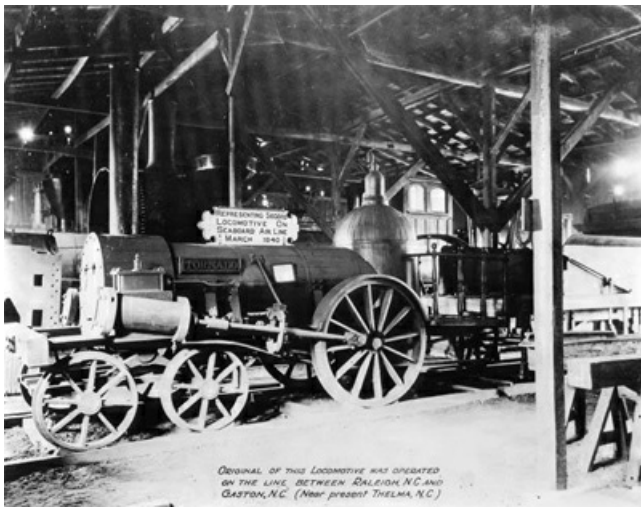
Black and white photograph of the locomotive model "Tornado," image taken circa 1950. Item H.1952.57.44 from the collections of the North Carolina Museum of History. The original "Tornado" engine would most likely have closely resembled this representation.