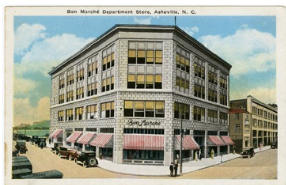
"Bon Marche Department Store, Asheville, NC."