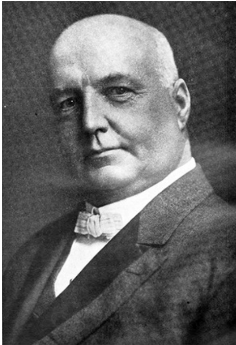
Photograph of Francis Donnell Winston, circa 1911.

[2] Francis Donnell Winston, lawyer, judge, state legislator, and lieutenant governor of North Carolina, was the third surviving son of prominent lawyer and planter Patrick Henry, Sr. [3] , and Martha Elizabeth Bird (or Byrd) Winston. Born in Windsor, Bertie County [4] , Francis or "Frank" Winston obtained his early education at Windsor Academy, at Fetter's School in Henderson, and at Horner School [5] in Oxford.