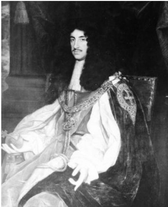
King Charles II."

The first permanent English settlers in North Carolina emigrated from the tidewater area of southeastern Virginia. The first of these "overflow" settlers moved into the area of the Albemarle Sound in northeast North Carolina around 1650.