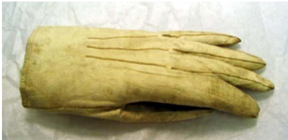
Photograph of the glove, a military uniform accessory circa 1860-65, of James I. Waddell, worn in the United Kingdom and France. Glove held in the collections of the North Carolina Museum of History.

The cruise of the Shenandoah , which had been a glorious adventure for Waddell and his crew, ended on a note of tragic irony. On 23 June 1865 they learned from newspaper accounts aboard a captured ship of General