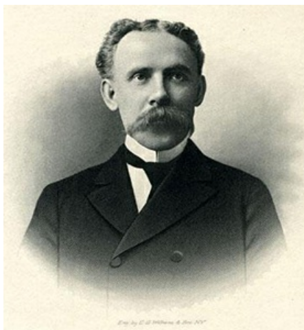
Engraving of Francis Preston Venable.

[6] In 1900, on the resignation of President Edwin Anderson Alderman [7] , who moved to the same post at Tulane University, Venable was elected president of The University of North Carolina. He soon proved to be both a capable administrator and an effective lobbyist who secured increased state financial support for the university. During his fourteen-year administration student enrollment increased steadily, and the university's financial position was greatly strengthened. The physical plant was enlarged and improved, faculty research was stressed, and athletics, in which Venable took a keen interest, were encouraged. The quality of the graduate school, organized in 1903 although graduate work had been offered earlier, and of the various professional schools was upgraded, and a number of departments achieved national recognition.