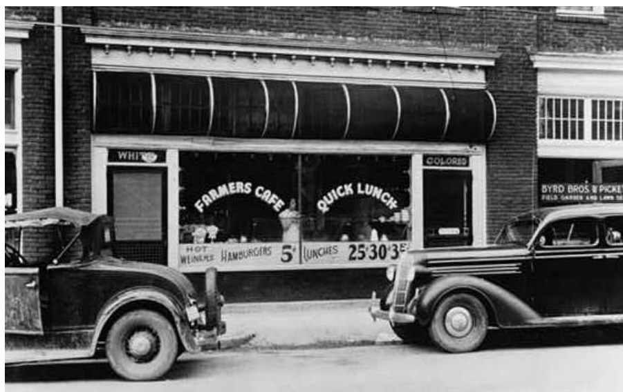
A cafe near the tobacco market, Durham, North Carolina.