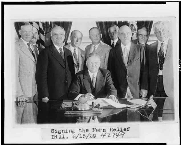
"Herbert Hoover signing the Farm Relief Bill, with nine other men standing alongside and behind him." June 15, 1929.

While the federal government under President Herbert Hoover's [9] administration attempted to provide some work and financial relief, the effects of the Depression nonetheless worsened from 1929 to 1932. Clearly, more drastic measures were required to avert further tragedy. Amidst these circumstances Franklin D. Roosevelt [10] was elected president in 1932, and with his inauguration the New Deal [11] was launched in 1933.