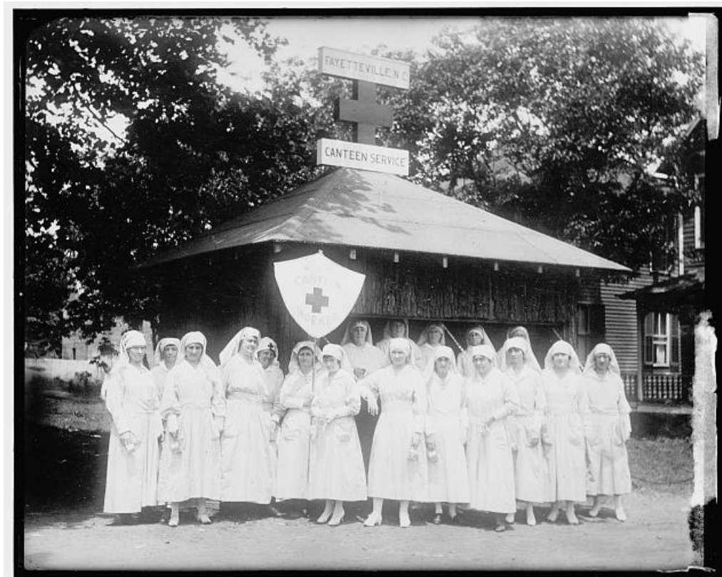
Fayetteville, N.C. Canteen Service. [Date created/published between 1910-1920]. American People"

See also: Great Depression [2] ; Public Schools in the Great Depression [3] ; 1920's [4] ; Agriculture During the Great Depression [5]