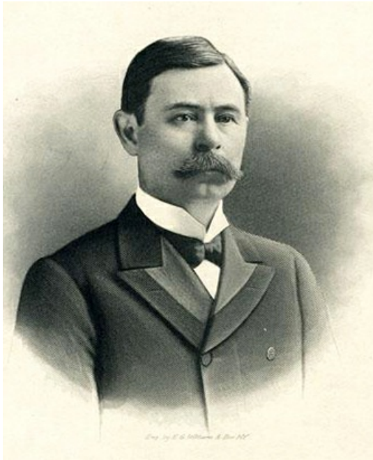
Engraving of Furnifold McLendel Simmons.

[2] Furnifold McLendel Simmons, U.S. senator, was born at his father's plantation near Pollocksville in Jones County [3] , the son of Furnifold Green, Jr., and Mary McLendel Jerman Simmons. He attended Wake Forest College [4] (1868–70), was graduated from Trinity College [5] in 1873, read law, and was admitted to the bar in 1875. Later he received honorary LL.D. degrees from Trinity (1901) and The University of North Carolina [6] (1915).