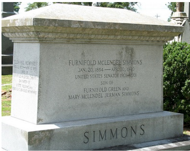
The gravestone of Furnifold McLendel Simmons in New Bern, 2009.

[30] Simmons was a professional politician of the late nineteenth and early twentieth centuries. In the Senate he frequently let local interests take precedence over national interests, and he lacked a consistent worldview; he did not understand the complexities of such a limited problem as alcohol or of such a fundamental one as that of the city; he believed in white supremacy and saw no incongruity in having second-class citizens in a democracy; he accepted a political philosophy of rewards and punishments and the electioneering trickery of less-than-fastidious friends. At the same time, his legislative record was impressive: waterways, roads, forest reserves, tariffs, taxes, the postal system, and agriculture all benefited from his effectiveness as a legislator.