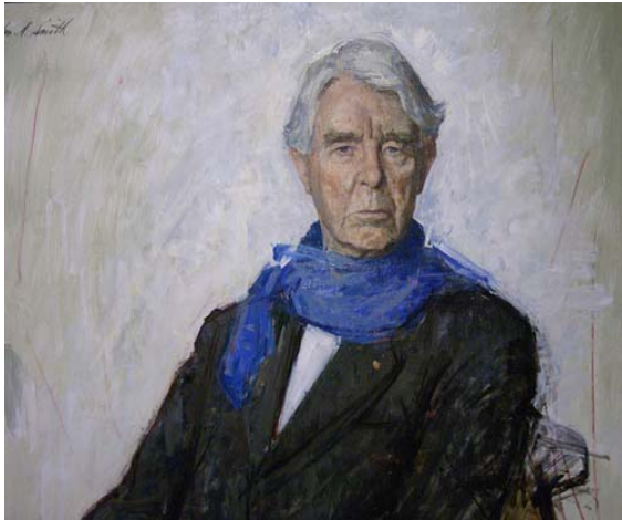
Portrait of Carl August Sandburg.

Carl August Sandburg, poet, journalist, biographer, and folk song recitalist, was a national celebrity long identified with the Midwest when he moved to North Carolina in 1945 after purchasing the historic Connemara [2] Farm at Flat Rock [3] . In