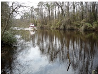
"Dismal Swamp Canal, North Carolina."