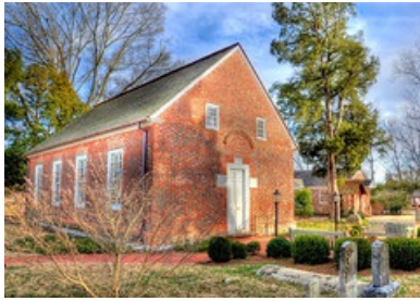
February 15, 2011. Bath, North Carolina. "St. Thomas Episcopal Church, Built 1734."