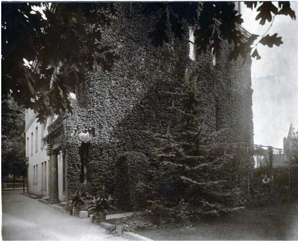
Photograph of the Olivia Raney Library, circa 1900. Item H.19XX.488.9, from the collections of the North Carolina Museum of History. [3]and vice-president and director of the Standard Gas and Electric Company.