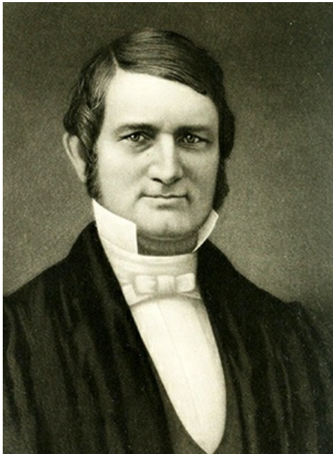
An engraving of Leonidas Polk during his time as missionary bishop of the Southwest.

[12] Polk settled in Louisiana in 1841, having been consecrated bishop of Louisiana in that year. For twelve years he attempted unsuccessfully to manage a vast sugar plantation at Bayou la Fourche while performing his ecclesiastical duties. Polk was also a prolific enslaver; Polk's Leighton plantation in Bayou la Fourche was worked by over 400 people that he enslaved. He conducted ceremonies for the people he enslaved, often marrying them with ceremony in the "big house" and establishing a Sunday school on the place. In 1849, a cholera outbreak killed one hundred of the people Polk enslaved, and, in 1854, Polk lost the plantation because of heavy debts.