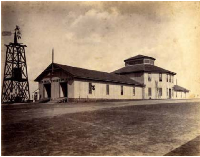
Photograph of the Central Exposition Building at the 1884 North Carolina Exposition.

[8] Eight State Fairs took place before the Civil War [9] began in 1861. Afterward, many North Carolina farms and plantations lay in ruins. Gradually, North Carolina's agriculture recovered, manufacturing increased, and the fair reopened. By 1884 state leaders could plan to stage the "Great North Carolina Exposition" to show "the variety and magnificence of the products and resources of North Carolina." This State Fair remained open for a month, at the second of Raleigh's three fair sites: on Hillsborough Street across from present-day North Carolina State University.