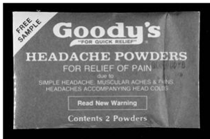
Photo of an old Goody's Headache Powder sample