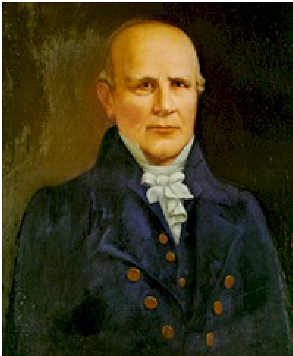
"Nathaniel Macon."

One important influence was the introduction of rail transportation [21] . Leaders in eastern towns like New Bern [16] and Wilmington [16] suddenly began to see that internal improvements [22] could transform their sleepy towns into thriving commercial centers. They began to view western reformers, who also supported transportation improvements, as allies in a crusade for state-financed railroads rather than as sectional enemies. In 1834, about twenty reform-minded easterners managed to win election to the General Assembly. In addition, Governor David L. Swain [23] , whose popularity extended beyond his native west, threw his influence behind reform and presented the new legislature with a compelling argument for holding a convention. A reluctant reformer, Haywood was put in charge of drawing up the bill that would authorize a convention.