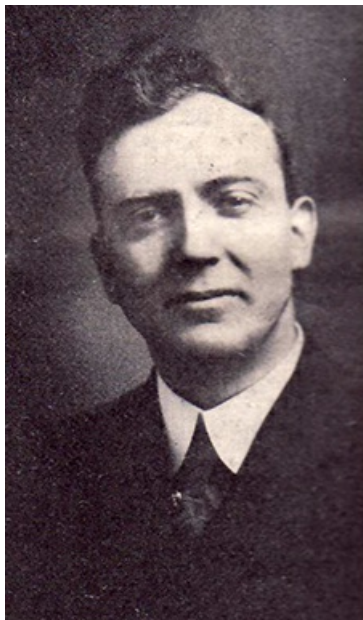
Photograph of John Johnston Parker published in 1922.