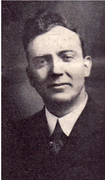
Photograph of John Johnston Parker published in 1922.

white [14] " and anti-Bryan "business respectables" faction that sought to promote and represent the state's nascent industrial interests. The youthful Parker climbed the orthodox political ladder—manager of John Motley Morehead [15] 's successful 1908 campaign for Congress, Seventh District congressional nominee against Democratic incumbent Robert N. Page [16] (1910), candidate for attorney general (1916), gubernatorial contender (1920), and member of the GOP National Committee and delegate-at-large to the Republican National Convention (1924). In his vigorous but losing (42.8 percent) 1920 campaign against Cameron Morrison [17] , he advocated woman suffrage [18] , protectionism, and opposition to the League of Nations treaty, and, at the state level, a variety of progressive programs: an income tax, a workmen's compensation law, protective legislation for women and children in industry, collective bargaining and a voluntary state labor arbitration system, improved highway and educational systems, and a more powerful and centralized executive branch. To the traditional race-baiting strategy of the state's Democratic party, he responded that the largely disenfranchised [19] negro as a class does not desire to enter politics. The Republican party of North Carolina does not desire him to do so."