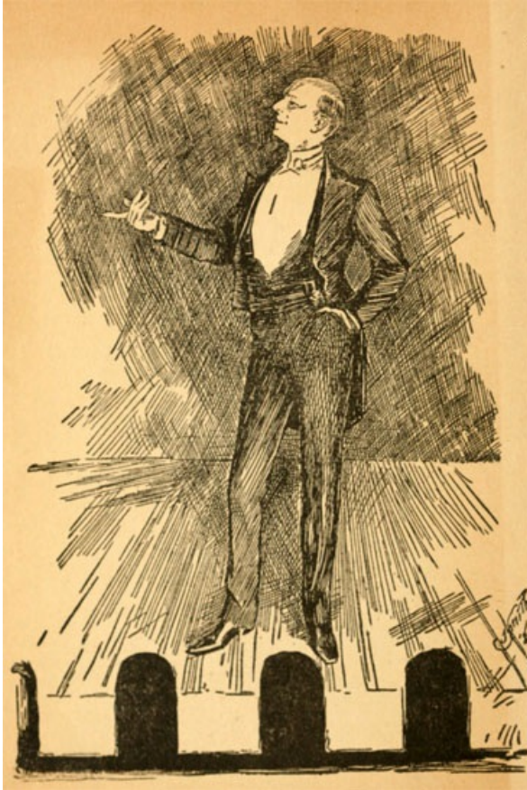
Illustration of Edgar Willson (Bill) Nye from Bill Nye's Red Book , published 1906 by Thompson & Thomas,

Bill Nye first visited the Asheville area in 1886 and was impressed with the scenery and climate, writing: "You will find