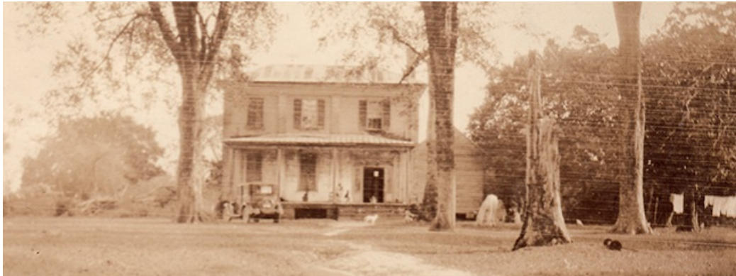
Photograph of Mulberry Grove, circa-1920-1940.