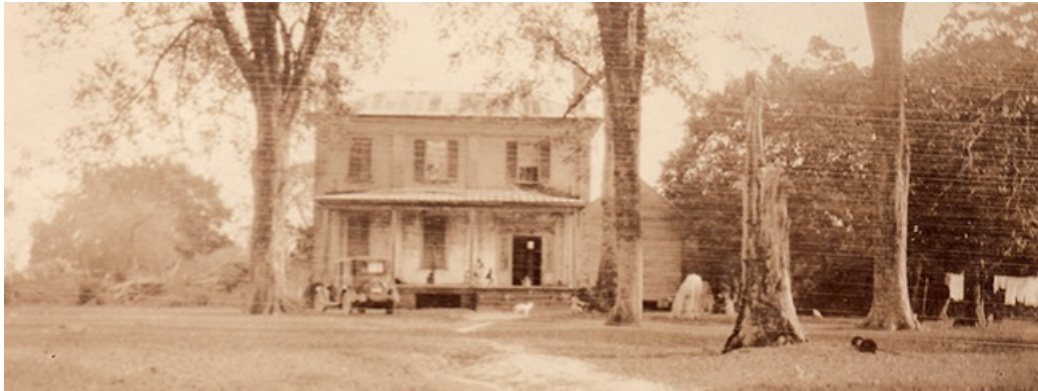
Photograph of Mulberry Grove, circa-1920-1940.