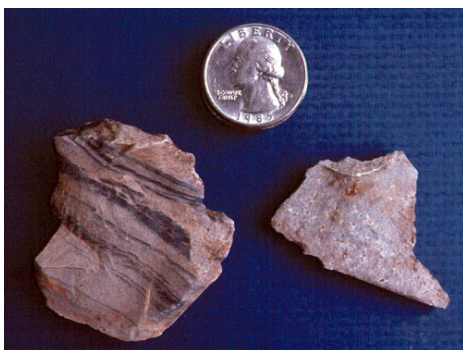
Flow-banded rhyolite [18] Studying the distribution of these points and the stone type from which they were made suggests that Paleo-Indian groups ranged over large portions of the state and adjacent regions. For instance,

Beyond this, what can be said about the Paleo-Indian period here? Some understanding of Paleo-Indian settlement comes from noting the distribution of fluted points across the state in both private and institutional collections. To date, I have recorded more than 250 points recovered from sixty-five counties. My analyses suggest that two point concentrations—or areas where the most fluted points have been found—cover the state. One covers the eastern Piedmont and inner Coastal Plain [16]. A smaller concentration is located in the Mountains [17]. These two areas are separated by a string of counties in the western Piedmont where no fluted points have been found.