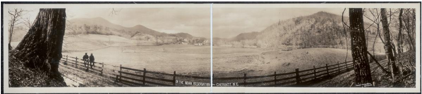
c. 1909. "On the Indian reservation, Cherokee, N.C."