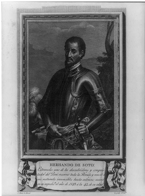
"Hernando De Soto [no date]."

The most prominent Native Americans to settle in the mountains of western present-day North Carolina were the Cherokee Indians [12] . Their first known contact with Europeans occurred in 1540, when Spanish explorer Hernando de Soto [13] and his men came to the mountains in search of gold. Following this brief encounter, the Cherokee and Europeans had limited contact until the late 1600s. A thriving trade developed between the Cherokee and White settlers in the early 1700s.