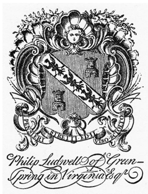
Bookplate of Philip Ludwell featuring his coat of arms.

Ludwell organized his government in North Carolina in the spring of 1690. His right to office was challenged immediately by one John Gibbs [10] , a Virginian who had gone to North Carolina, acquired land, and proclaimed himself governor about the time of Sothel's expulsion. Gibbs claimed that Ludwell's appointment was invalid, apparently basing his claim on the Fundamental Constitutions [11] of Carolina, which restricted the governorship of the Carolina colonies to resident Proprietors, heirs apparent of Proprietors, and members of the Carolina nobility [12] (in which the ranks were landgrave and cacique). Gibbs, a relative of one of the Proprietors, had been made a cacique of Carolina in 1682, but he had settled in Virginia instead of Carolina. On the departure of Sothel, a Proprietor, there was no one in North Carolina qualified for the governorship under the Fundamental Constitutions, which no doubt prompted Gibbs's move to that colony. As Ludwell had sold his wife's proprietorship, he had no claim to the governorship other than his commission from the Proprietors, who either did not know of Gibbs's action or chose to ignore it.