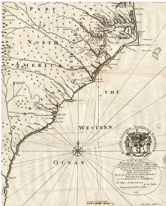
John Lawson's 1709 map of North Carolina.