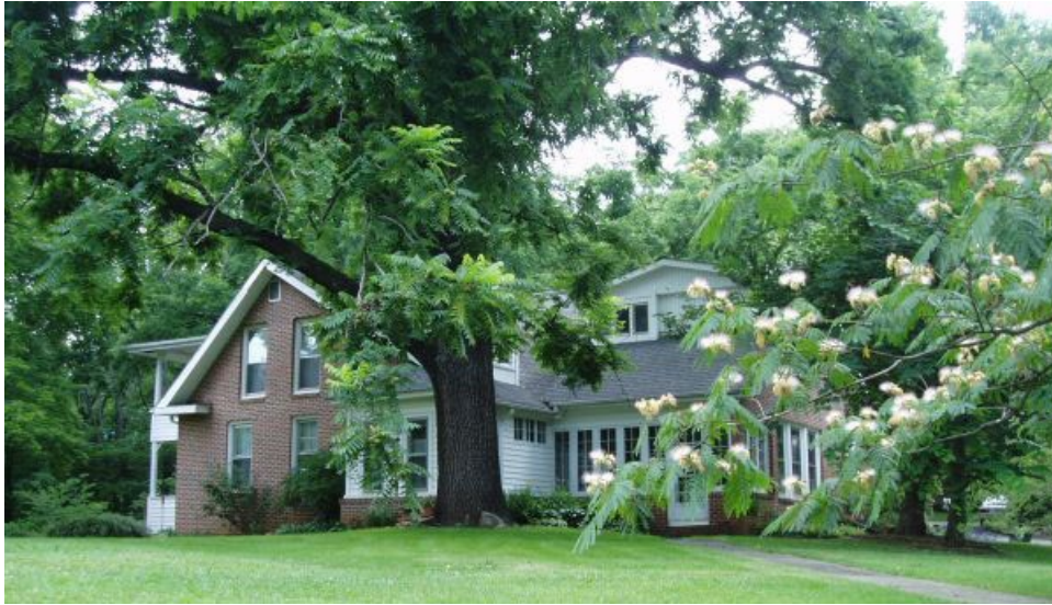
This house is located at Lynn in Polk County. [8]