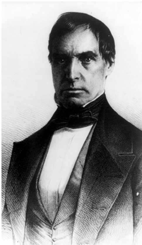
An engraving of William Rufus Devane King. Image from the Library of Congress.

King was reelected to the Senate in 1822 by a narrow margin and in 1828 without opposition. Although he supported John Quincy Adams for president in 1824, he soon became disillusioned with his policies and joined many other Alabamians in endorsing Andrew Jackson. He opposed the tariff acts of 1824 and 1828 and took a special interest in Indian removal and in public land measures. After Jackson's election, King became one of the major administration leaders in the Senate.