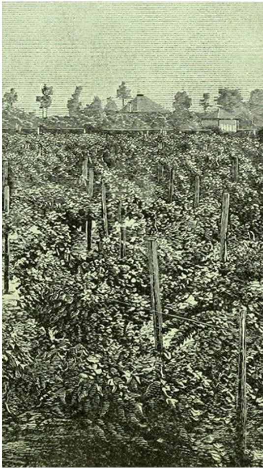
Engraving of the Tokay Vinyards, 1880.