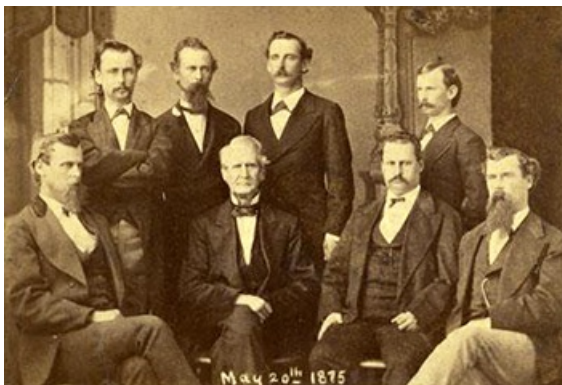
A photograph of William Alexander Graham and his seven sons, May 20, 1875.

Ironically, Graham's national reputation was more easily regained. He carried on an extensive correspondence and was evidently widely esteemed. In 1867, he was appointed to the original board of Peabody Fund [42] Trustees and served faithfully in that capacity until his death. He was also on the arbitration commission to settle the Virginia-Maryland boundary dispute, and by 1875 he had become the principal figure in the long-delayed deliberations of that group.