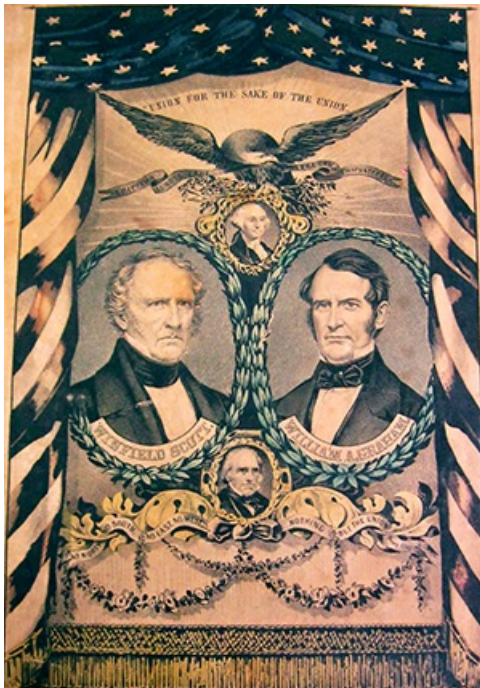
Presidential campaign poster for the Whig Party, 1852, with portraits of Winfield Scott and William Alexander Graham.

After declining European diplomatic appointments offered by Zachary Taylor, Graham agreed to become secretary of the navy in July 1850, when Millard Fillmore formed a cabinet that supported the proposed compromise measures then before Congress. Initially his role was largely political, as he promoted passage and acceptance of the Compromise of 1850. He viewed the compromise as the final resolution of long-standing sectional controversies. To both North and South he advocated moderation, advising the North that faithful execution of the Fugitive Slave Law was essential to perpetuation of the Union. Although he knew little of naval affairs and never fully grasped the significance of contemporary technological advances, Graham was an experienced administrator. He relied heavily on knowledgeable advisers such as career officer Matthew Fontaine Maury [24] . Secretary Graham was the moving spirit in several notable activities including a constructive program of personnel reforms, exploration of the Amazon basin, and the Perry expedition to Japan. The authoritative naval historian Samuel Eliot Morison [25] has characterized Graham as one of the best navy secretaries in the nineteenth century.