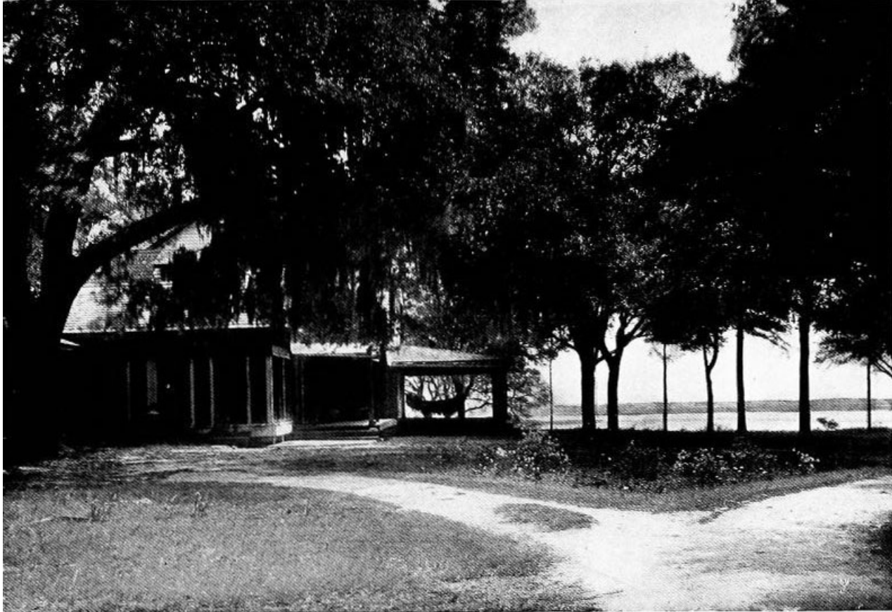
ON MASONBORO SOUND

Thomas Godfrey, Jr., mercantile agent, poet, and dramatist, was born in Philadelphia. His father was