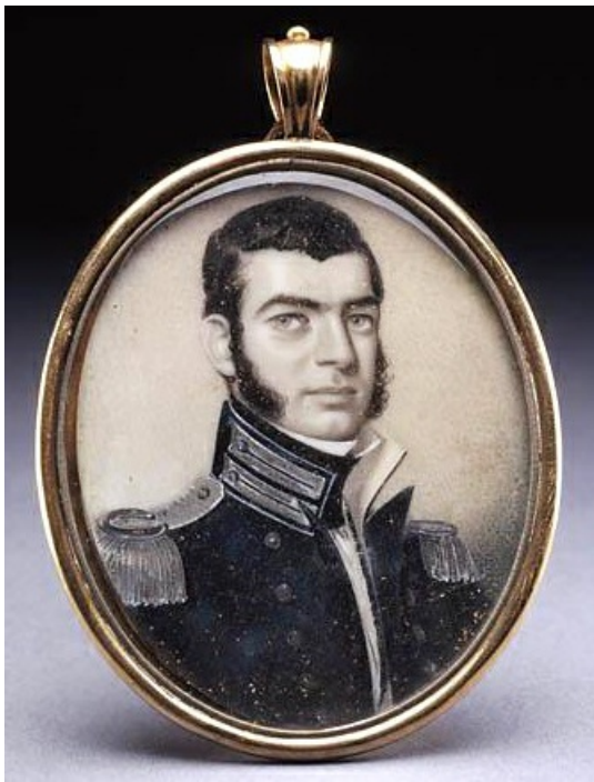
"Miniature, Accession #: H.1966.1.1." 1840. North Carolina Museum of History.

[8] from 8 July (confirmed 16 August). Placed in charge of the Department of North Carolina, he was assigned the almost hopeless task of building the state's coastal defenses. Gatlin found little to work with, as gunboats, artillery, equipment, labor, and especially troops were not available to defend the Outer Banks [9] , its ports, and its hundreds of miles of inland sounds and rivers. Inevitably, the Union Army—in its initial attack against the coast—easily overpowered the weak defenses of Hatteras Inlet [10] in late August 1861. Gatlin then attempted to strengthen the defenses of Roanoke Island [11] and New Bern, making numerous appeals to Confederate authorities in Richmond for reinforcements. However, because of the demands for troops and supplies in other parts of the Confederacy, his requests were ignored. Consequently, his men could not resist the powerful Union forces of General Ambrose Burnside when they arrived on the coast in late January and early February 1862. Roanoke was captured on 8 February and New Bern fell on 14 March.