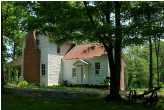
May 7, 2008. "Mendenhall Plantation."

Today few people know the story of the antislavery movement in North Carolina, even though one of the era's most famous activists came from the state. Levi Coffin [5] (1798–1877)—who became known as "the President of the Underground Railroad" for his determined and vocal campaign against slavery—grew up in the New Garden Quaker community of Guilford County [6] . Although Quakers [7] —members of the Religious Society of Friends, a Christian group—opposed slavery, people disagreed over the best way to express that opposition and help those who were enslaved. Helping runaway slaves was a criminal act with severe penalties. Many Quakers drew the line at breaking the law.