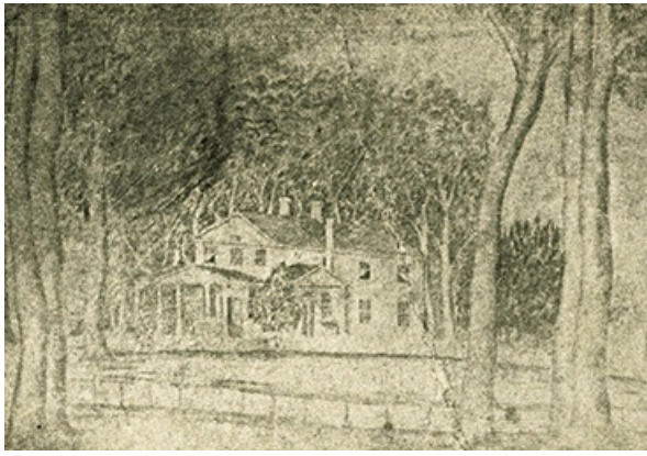
Postcard of "The Grove, " Halifax, N.C.