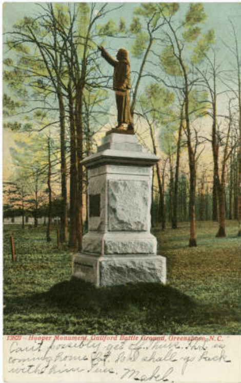
Hooper Monument, Guilford Battle Ground, Greensboro, N.C.