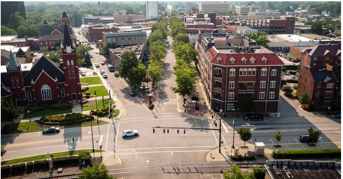
Aerial view of downtown Fayetteville.

Fayetteville hosts two colleges: Fayetteville State University [15] (started in 1867 as Howard School) and Methodist University [16] . The city is also home to the Museum of the Cape Fear [17] and the Airborne and Special Operations Museum [18] .