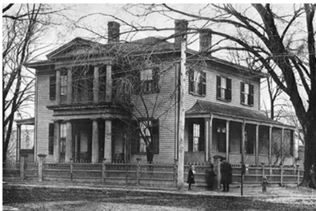
A 1906 photograph of William Woods Holden house in Raleigh.

Although many efforts were made to remove his political disabilities, Holden refused to participate, insisting that such movement must come voluntarily from the people of the state and without political friction. Until 1889 he participated in local affairs, acting as unofficial head of the state Republican party (until he could no longer support the national policies of high tariffs, pro-business, and nonsupport for the South), writing for the Raleigh and Charlotte newspapers, composing poetry, taking part in church functions, and lecturing. His address, " History of Journalism in North Carolina ," [30] delivered before the press association on 21 June 1881 in Winston, came to be considered one of the masterpieces of the state's journalistic history.