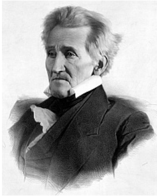
Lafosse, after Brady's Daguerreotype, Andrew Jackson, 1856.