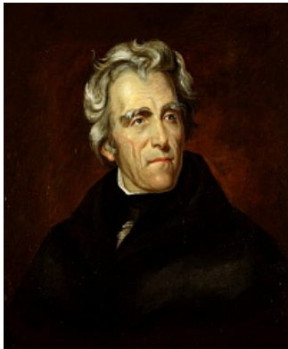
Thomas Sully's portrait of Andrew Jackson, ca. 1857.

Jump to: Childhood • The American Revolution • Public Career • Politics and Elections • The Presidency • Retirement