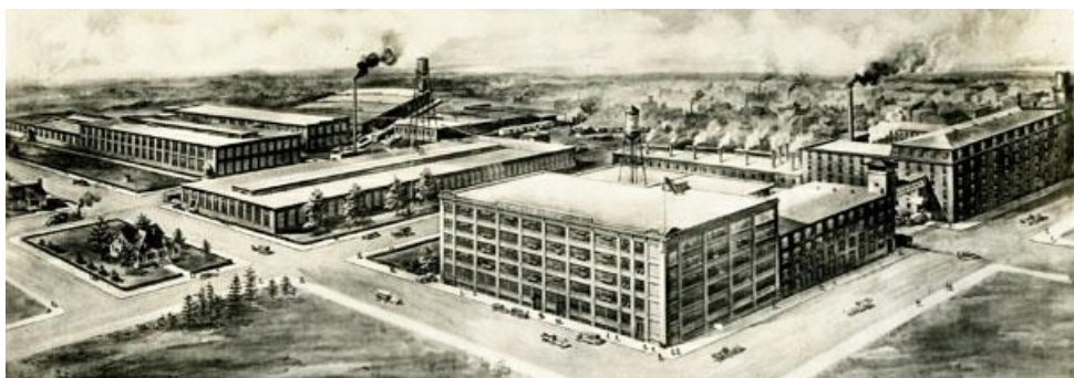
Illustration of the P.H. Hanes Knitting Company in Winston-Salem, circa 1920-1930.