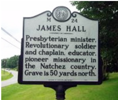
Photograph of the James Hall Highway Marker.