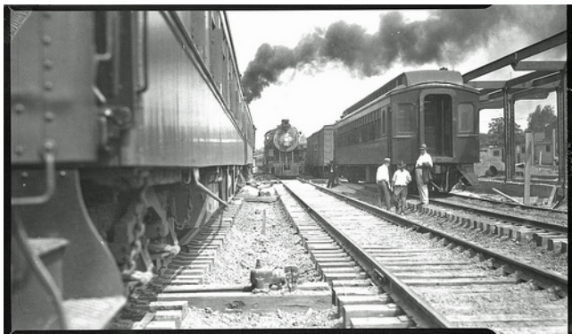
Southern Railway Station, Greensboro, NC, ca.1929.

[11] For most of the Antebellum period, Greensboro could perhaps be best described as just another sleepy courthouse town, not unlike many others in North Carolina, although it did become the home of the state's first steam-powered cotton mill, the Mount Hecla Mill [12] .