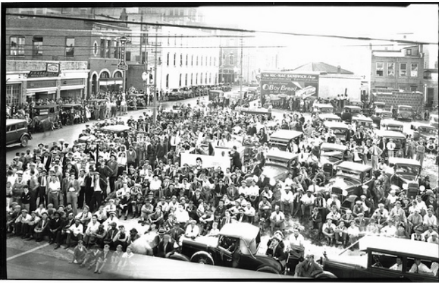
Crowd gathered near intersection of E. Gaston and N. Davie Streets, c.1930.

[36] By the early 20 th century, the Gate City had become one of North Carolina's largest and most important cities, and the boom years of the 1920s saw rapid growth. In 1923, Greensboro annexed enough property to increase its size to almost eighteen square miles and over 45,000 people, making Greensboro North Carolina's third-largest city. The new 17-story Jefferson Building [37] , then the tallest and largest office building in the South, dominated the Greensboro skyline. Insurance became a major industry as Jefferson Standard and Pilot Life grew. In 1927, the downtown area acquired a new railroad station, the Carolina Theatre and the King Cotton Hotel. An airport west of the city increased Greensboro's strength as a transportation hub.