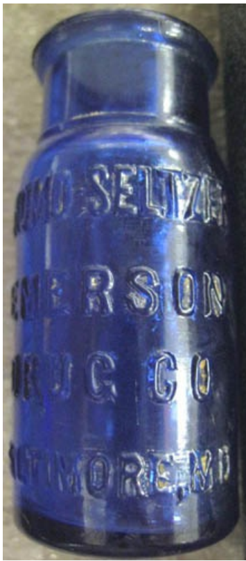
Bromo-Seltzer bottle.

[7] purchased several yachts including the Susquehanna , the Margaret , and the Queen Anne . These were used for hunting expeditions, social entertainment, and extensive world travel.