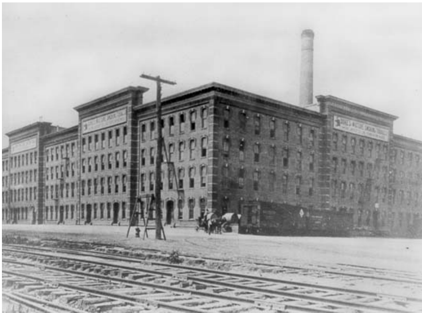
"W. Duke, Sons & Co., branch of American Tobacco Co. ca. 1900."