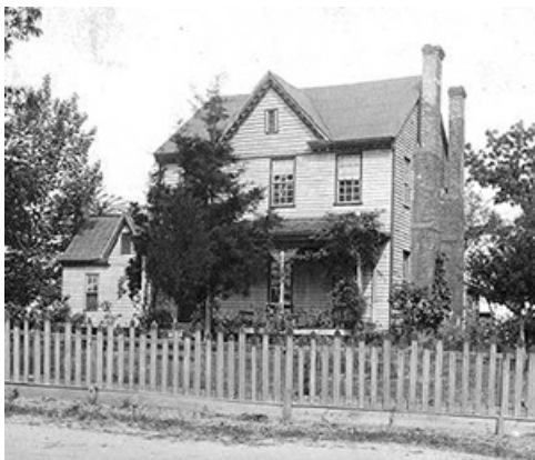
Photograph of William Richardson Davie's house in Halifax, circa 1900-1914.

[21] When he returned to North Carolina, Davie found that the political scene had changed in both state and national politics with the election of Thomas Jefferson and the Democratic-Republicans. A Federalist in a thoroughly Democratic state, his political fortunes began to decline, and he lost out in the campaign of